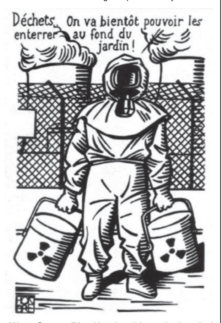
'Waste. Soon you'll be able to bury it in your back garden.'