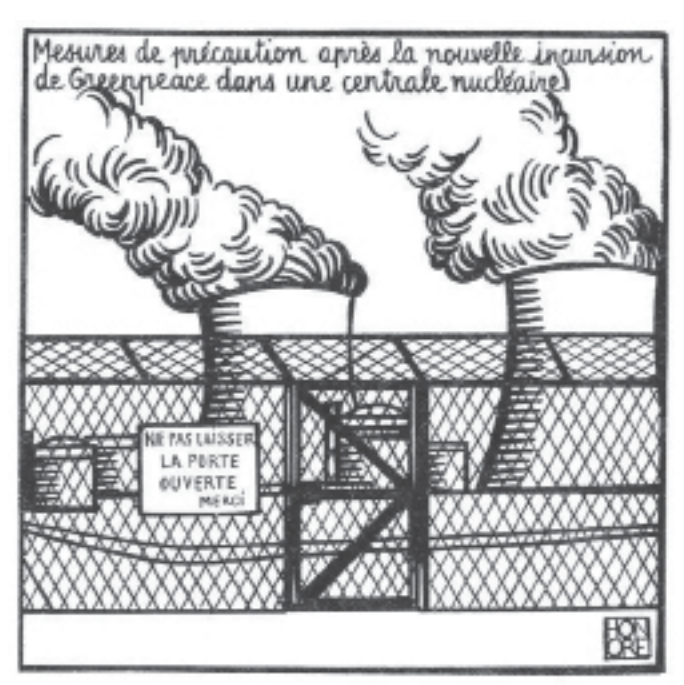
'Precautionary measure after Greenpeace's latest incursion into a nuclear plant. ''Do not leave the gate open. Thank you.'

Some nuclear cartoons from Charlie Hebdo are posted at: http://sortirdunucleaire.org/Solidarite-Charlie